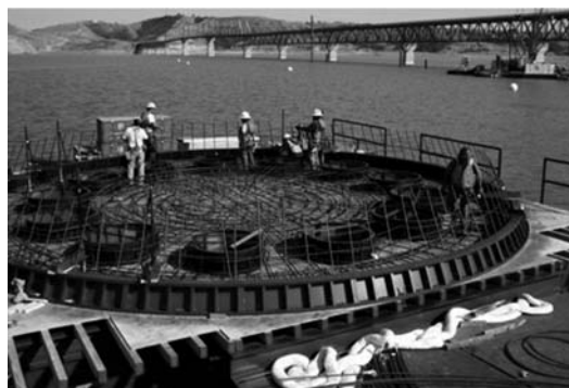
Figure 3: Pier 3 of the third Four Bears Bridge in 2004 (NDDOT, 2005)

be installed before concrete could be poured in pier 2 of the previous bridge in 1955. Figure 3 shows the constructor's modern day approach where a concrete cofferdam was formed and poured on a barge at the shore before it was transported to its final location.