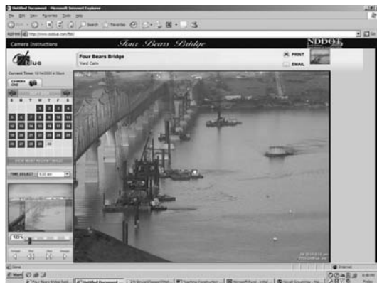
Figure 6: Four Bears Bridge photograph taken 30 September 2004 at 9:10 am.

were taken every ten minutes on this project, the student was able to pull up 9:10 am on September 30 to see a boat pushing a barge and cofferdam base into the proper location (see Figure 6).