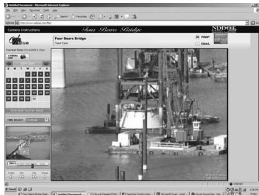
Figure 5: Four Bears Bridge photograph taken 9/30/04 at 11:05 am.